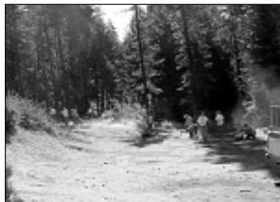
PLINK members hard at work.