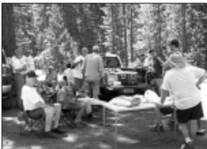
PLINK members taking a break for lunch.